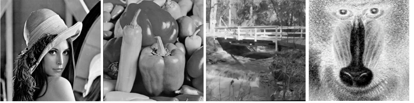
Fig. 1. Images used for denoising algorithm testing

and \beta was tuned to give the best result in terms of PSNR.