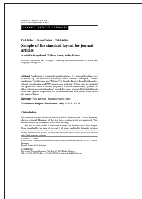
[onecolumn] (default) available format options